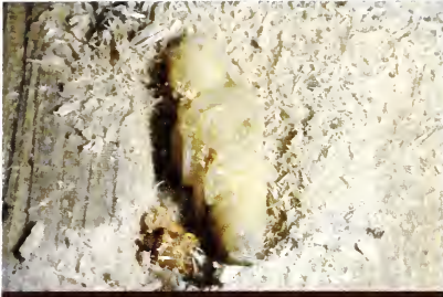
Figure 3. An ALB pupa.